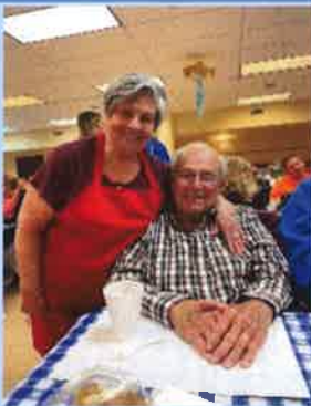
St. Vincent DePaul (center)