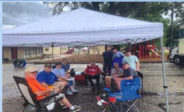
Trivia Night (right)