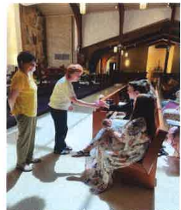
Pro-Life Committee Rose Presentation

* Includes $808,910 (FY 22) in restricted building and cemetery funds